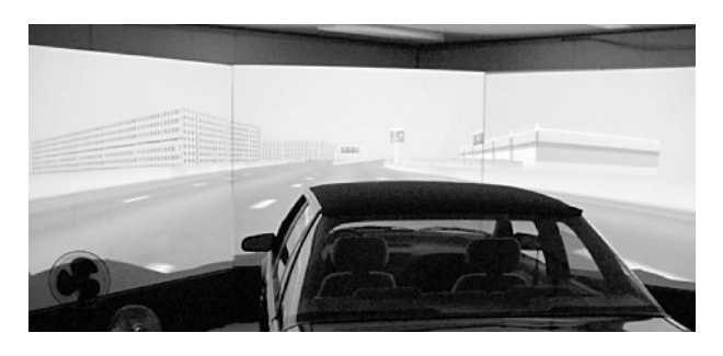
Figure 2 University of Massachusetts driving simulator.

lag behind it a reasonable distance (the lead vehicle indicated to the participant driver when to turn and in which direction).