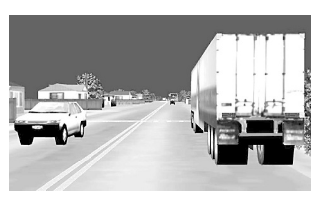
Figure 3 Simulator view: truck crosswalk scenario.

One of the potential weaknesses of the above study is that the trained novice drivers were evaluated on the driving simulator immediately after they had completed the PC based training. In order to remedy this shortcoming, the above study was replicated, only this time 12 novice drivers were evaluated on the simulator 3–5 days after training.<sup>29</sup> This represents a period of time which might elapse between PC based training in driver education classes and the novice driver's applying that training on the road as part of the learner's permit phase. Another set of 12 participants was